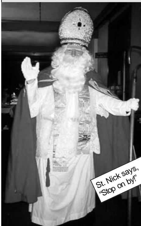
St. Nick says, "Stop on by!"